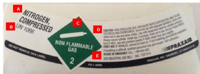
A Name of Product, B Material identification number, C Hazard diamond, D Hazards and precautions, E Contact information