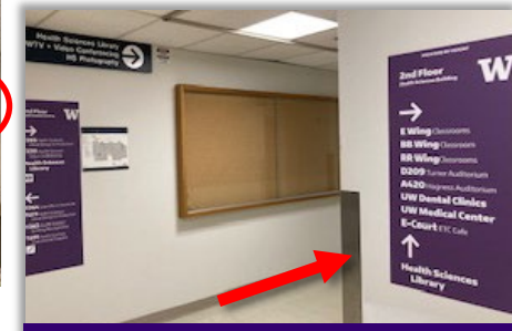
5b. Turn right at the end toward the library