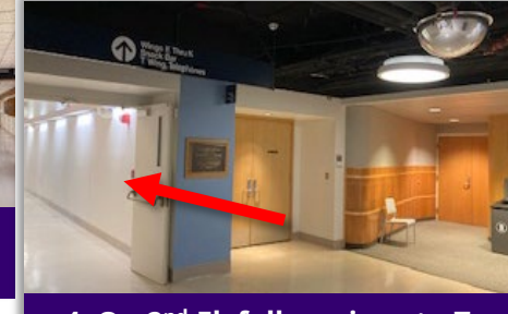
4. On 2<sup>nd</sup> Fl, follow signs to Twing & library