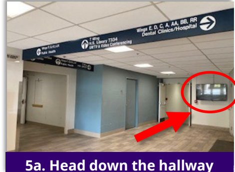
next to the TV monitor