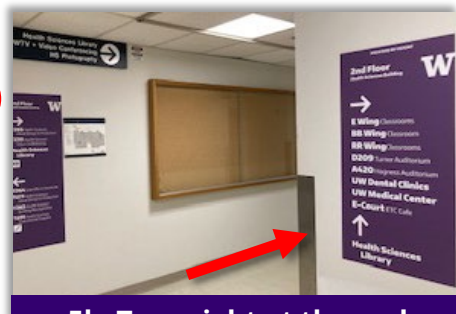
5b. Turn right at the end toward the library