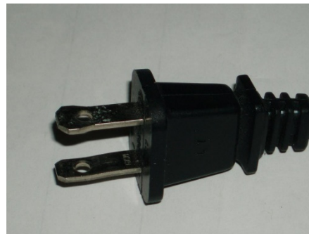
Polarized non-grounded plug (one prong larger than the other)

A smaller "gauge" number indicates a thicker cord. A 16 gauge cord is considered light duty and only appropriate for equipment up to 13 amps (e.g., portable lights and fans). A 14 gauge, or medium duty cord, is suitable for equipment with draws from 14 to 15 amps, such as portable power tools. Equipment with draws between 16 and 20 amps require 12 gauge (heavy duty) or 10 gauge (extra heavy duty) cords. This includes items such as air compressors and electric chain saws. When using cords greater than standard lengths, heavier cords are required. For planning purposes, the following table shows recommended gauge based on length of cord.