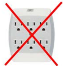
Plug adapter without a circuit breaker, not allowed