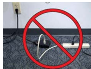
Surge suppressor daisy-chained to an extension cord, not allowed