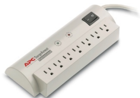
Surge suppressor with indicator. Look for UL 1449 listing