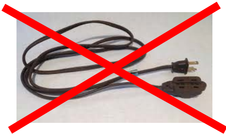
Inexpensive extension cord with 18 gauge wire, not allowed