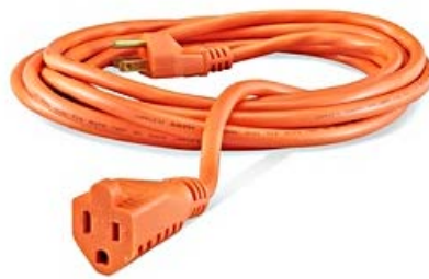
Typical UL Listed 16 gauge grounded indoor/outdoor polarized extension cord