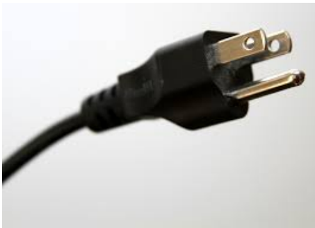
Grounded heavy gauge cord